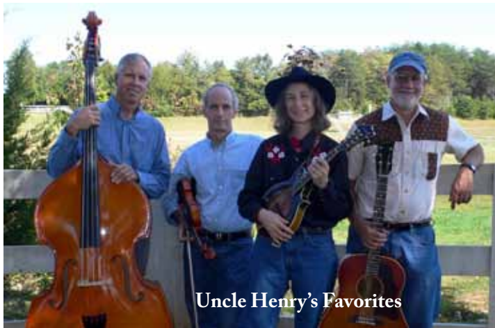
Uncle Henry's Favorites

Queen Elizabeth's High School, Morton Terrace, Gainsborough, Lincolnshire DN21 2ST