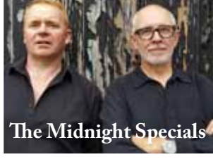
The Midnight Specials

Book online at www.footmad.org.uk or use our secure PayPal account: paypal@footmad.org.uk