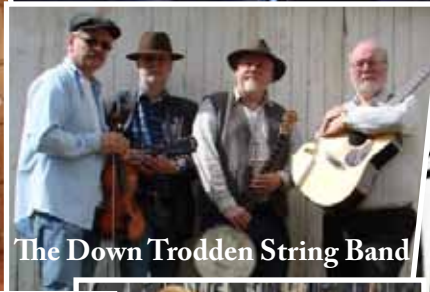
The Down Trodden String Band