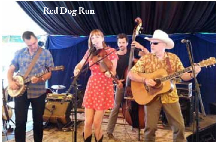
Red Dog Run

DON'T MISS THIS SUPERB LINE-UP at Europe's largest and best Old-Time festival The weekend includes concerts, a square dance and workshops for step dancing, harmony singing, beginners' ukulele, beginners' banjo, fiddle tunes of Henry Reed and all the usual instruments. Plus trade stands, great food and bar on site. Indoor sleeping, outdoor camping, RV standing. Unbeatable jam sessions and much, much more! Advance booking highly recommended.